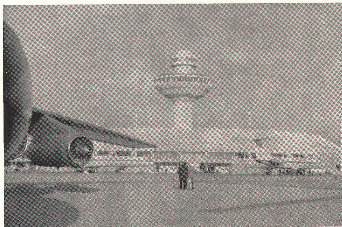
SOVIET TERRITORY — Looking past the nose of an Air Guard C-141 from the 172nd Military Airlift Group, the airport tower and two Soviet Aeroflot aircraft are visible in front of the terminal at the airport in Yerevan, Armenia.