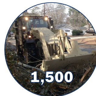
MILES OF ROADS CLEARED