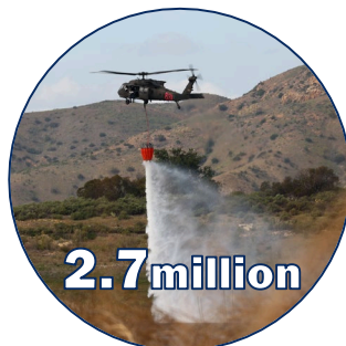
GALLONS OF RETARDANT DROPPED