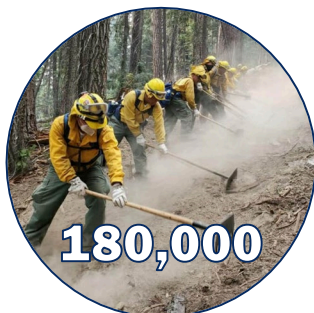
PERSON-DAYS OF SUPPORT