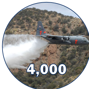
AERIAL DROP MISSIONS