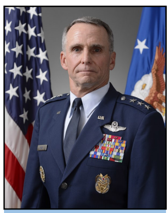
Lt. Gen. Anthony Rock

We have seen success in units that follow these principles; you can call it "embracing the red," but it is really no more than understanding what is going on in your unit and accepting the risk at the appropriate levels. Command-