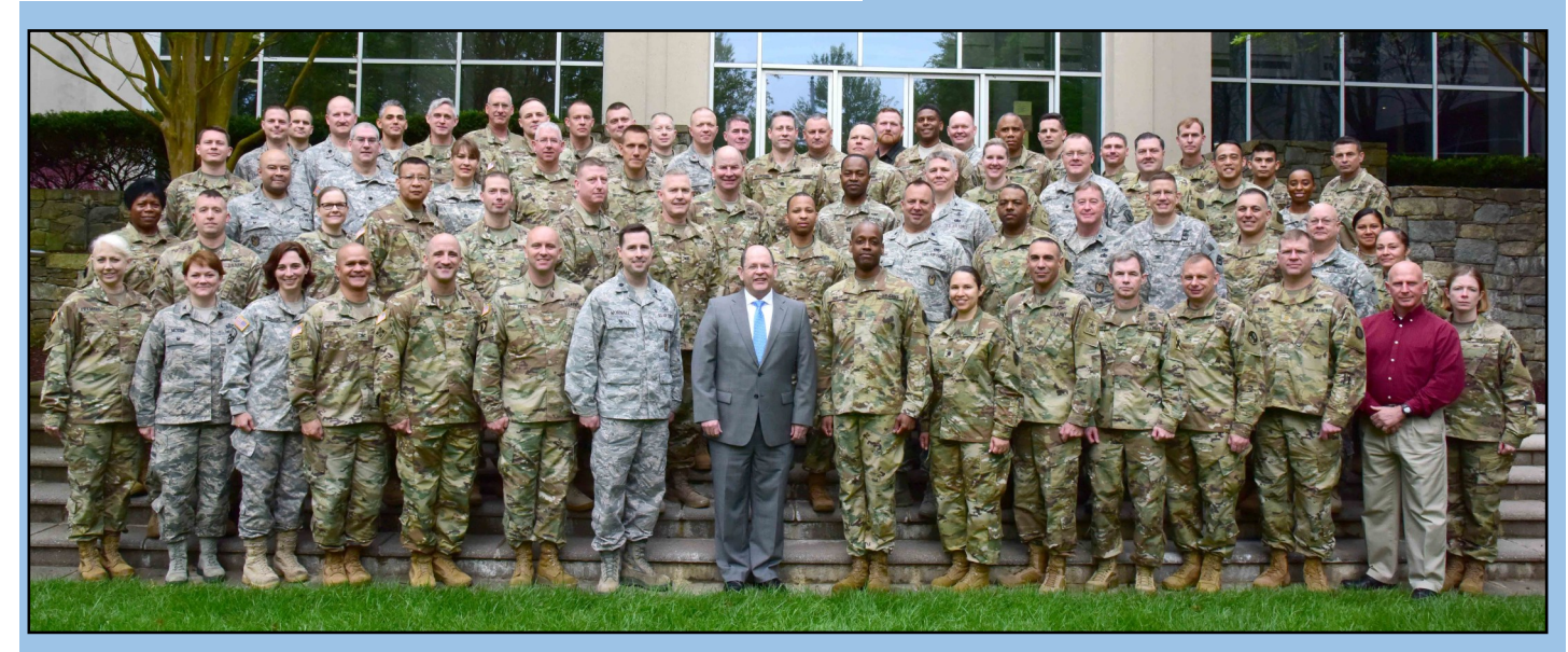
National Guard IGs gather for a NG IG workshop, at the Herbert R. Temple, Jr. Army National Guard Readiness Center, Arlington, VA., April 20, 2017. The NG IG workshop provided an opportunity for NG IGs from the 50 States, 3 Territories and District of Columbia, to collectively establish future courses of action for program improvements. IGs were also briefed on updated IG regulations, policy changes, and NG specific topics.