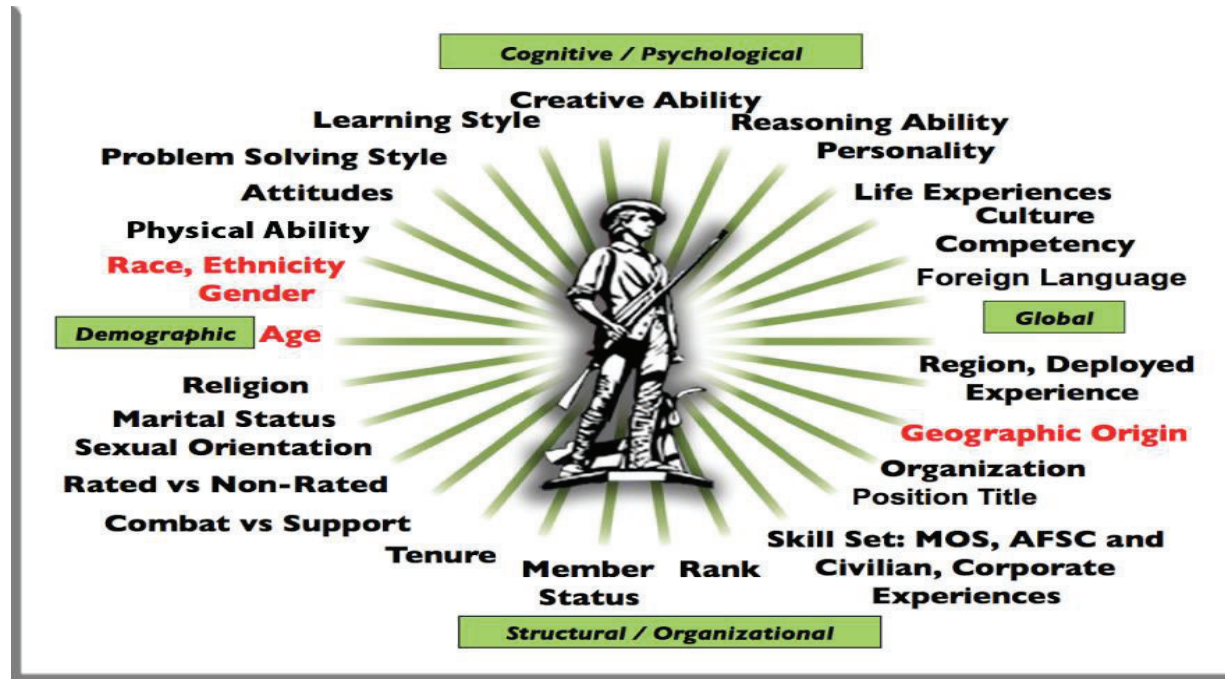
Figure 3: The Four Major Components of Diversity, NGB DI, 2016

Workforce diversity is a collection of individual attributes that helps agencies pursue organizational objectives efficiently and effectively. Figure 3 highlights four major areas of diversity that include demographic, global, cognitive, and structural aspects of an individual. These are not limited to characteristics such as national origin, language, race, color, disability, ethnicity, age, religion, sexual orientation, gender identity, socioeconomic status, veteran status, and family structures.